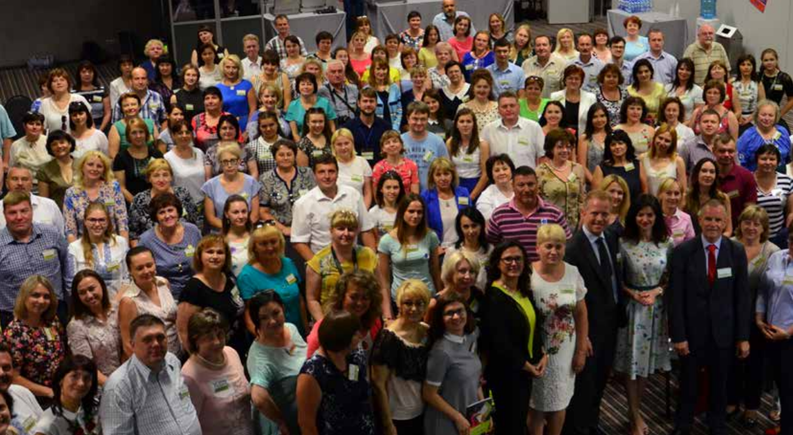
150 participants from more than 70 schools took part at the National Conference for the Schools for Democracy Programme in June 2017.