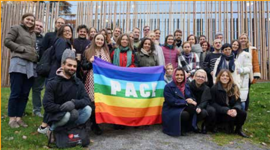
Participants at the Utøya training on the Council of Europe manual WE CAN – Taking action against Hate Speech through Counter and Alternative Narratives.