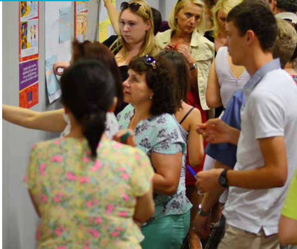
Presenting their school projects. Participants at the National Conference of the Schools for Democracy Programme in Ukraine.