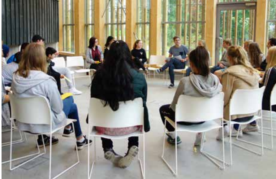
Students from lower secondary schools in Norway taking part in a training at Hegnhuset at Utøya.

More info at http://www.theewc.org/Content/What-we-do/Practicing-Citizenship/Practicing-Citizenship