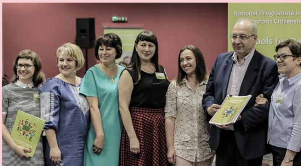
Deputy Minister of Education in Ukraine, Pavlo Hobzey, took part at the presentation of the Tool for Democratic School Development.

publication Signposts – policy and practice for teaching about religions and non-religious worldviews in intercultural education. With a small group of experts, EWC in partnership with Council of Europe, has developed a training module based on Signpost, aiming to turn the theory in the publication into a more practice-oriented tool for teachers.