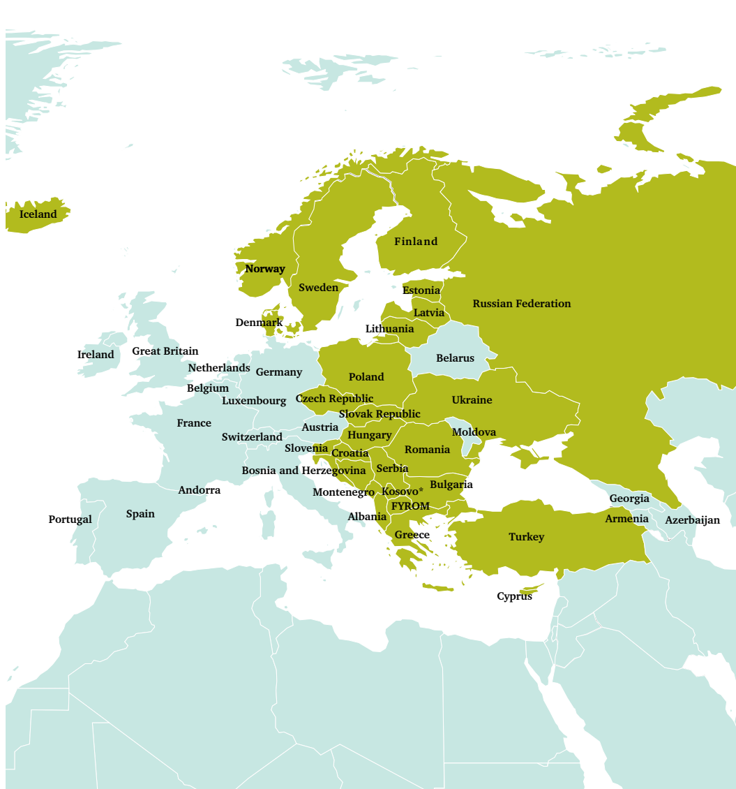
EWC's activities reached multipliers in 27 member states.

tutes, and in informal education such as NGOs, museums, and more. The aim is for institutions to develop and offer quality programs and activities in Education for Democratic Citizenship and Human Rights Education (EDC/HRE) as well as to strengthen institutional capacity, practices, governance and professional development.